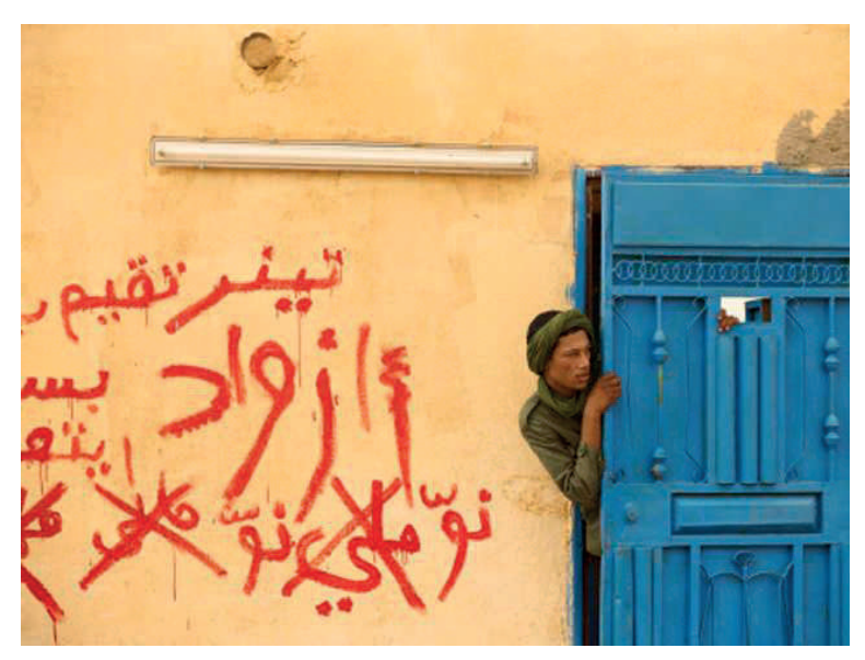
Figure 4. A wall showing graffiti in ajami Tamasheq and ajami French: Tenere taqqim, Azawad, non Mali, non Mali 'The desert forever, Azawad, no Mali, no Mali.'