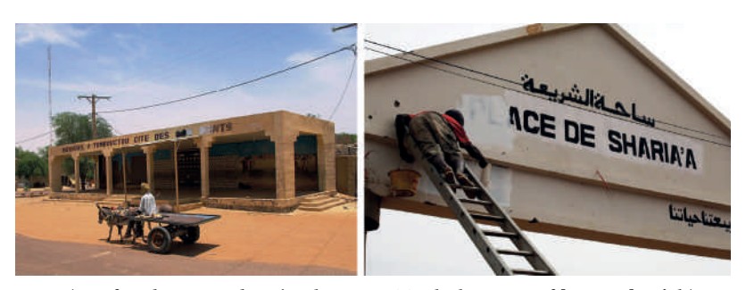
Figure 6. a) Defaced sign reading 'Welcome to Timbuktu, city of [333 sai]nts'; b) Painting over 'Sharia Square' in Gao

When northern Mali was first liberated from Islamist control in early 2013, the urban populations in turn attempted to reclaim their public spaces in a number of ways. Women walked in the streets without hijab, men smoked cigarettes in public, and people began to alter the signs that had been installed by the jihadists. The large signs announcing that the cities were subject to the rule of sharia were scribbled on or painted over, as was the sign for Gao's Sharia Square (Figure 6b).