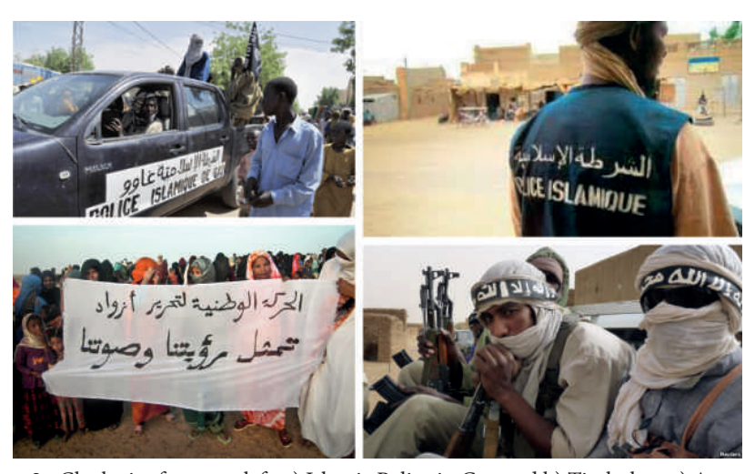
Figure 2. Clockwise from top left: a) Islamic Police in Gao and b) Timbuktu; c) Ansar Dine members in Kidal; d) Women's pro-MNLA demonstration in Timbuktu: 'The National Movement for the Liberation of Azawad — it represents our vision and our voice.'

As the name straightforwardly reflects, the political goal of the Mouvement National pour la Libération de l'Azawad (MNLA) was to liberate the territory known as Azawad from the Malian state, and thus to form an independent Tuareg