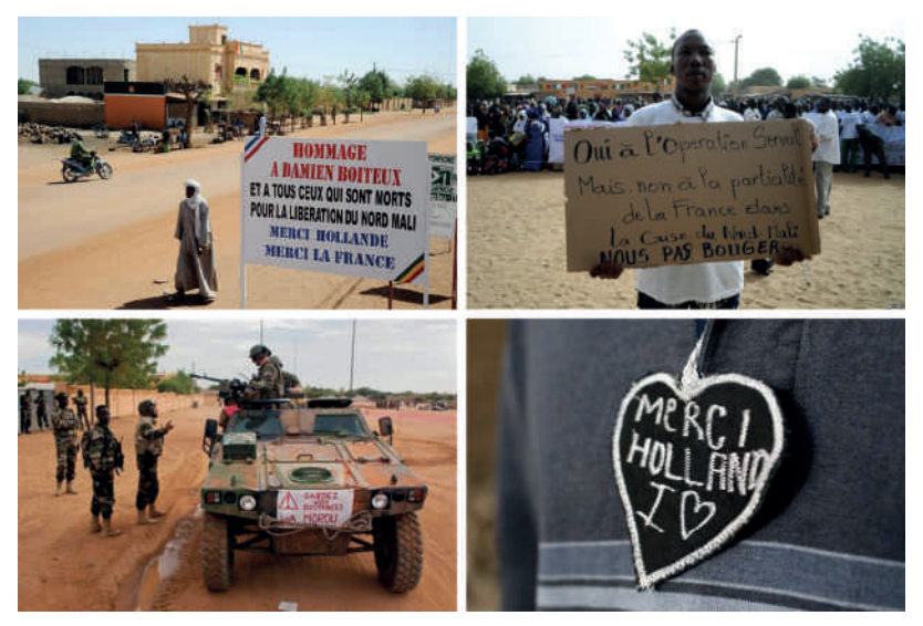
Figure 7. Clockwise from top left: a) 'Hommage to Damien Boiteux and all who died for the liberation of northern Mali. Thank you Hollande. Thank you France'; b) Gao, 'Yes to Opération Serval, but no to the partiality of France in the Northern Mali crisis. WE WON'T BUDGE'; c) Embroidered message of gratitude; d) French army vehicle, 'Keep your distance. Stand back.'