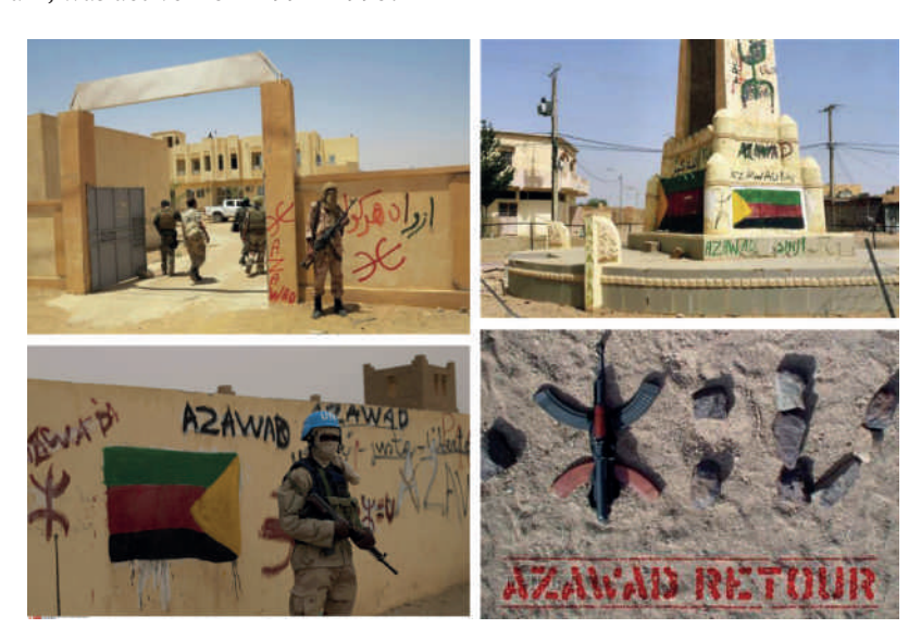
Figure 3. Clockwise from top left: a) MNLA headquarters in Kidal; b) Monument in Kidal; c) A sinister rendering of Azawad; d) UN troops outside the former MNLA headquarters in Kidal

movement in Niger known as the Popular Movement for the Liberation of the Aïr and the Azawak, two northern regions of Niger inhabited primarily by Tuareg and Fulani, was active from 1991-1995.