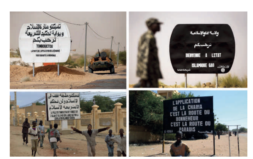
Figure 5. Clockwise from top left: a) 'Timbuktu (the beacon of Islam and) gateway to the application of sharia, welcomes you'; b) 'The Islamic state of Gao welcomes you / Welcome to the Islamic state of Gao'; c) 'The application of sharia is the path to happiness. It is the path to paradise'; d) 'The city of Timbuktu is founded on Islam and will be judged only by Islamic law (sharia).'

Many of the Islamists' signs are bilingual, written in Arabic and Mali's official language, French, and some exhibit characteristics of grassroots literacy, such as the French sign in Figure 5c, where the word bonheur 'happiness' is written as bonneheur. More than simply marking territory as the MNLA's inscriptions tended to do, signs written by the Islamist coalition made explicit statements about the rule of law (sharia) that they were attempting to impose within a city, thereby dictating multiple aspects of personal behavior, such as the wearing of hijab and the interdiction of smoking and drinking alcohol. The bilingual signs placed Arabic on top, symbolizing its superiority as the language of religion to French, or else the signs were in Arabic on one side and French on the other. The photograph in Figure 5d captures the striking juxtaposition of a billboard announcing that Timbuktu will be judged only by sharia, and the international hip-hop graffiti in English that reads 'MILLIONAIRE' and 'GANGS STAR' on the wall beside it, which speaks to the cosmopolitan yearnings of the city's youth.