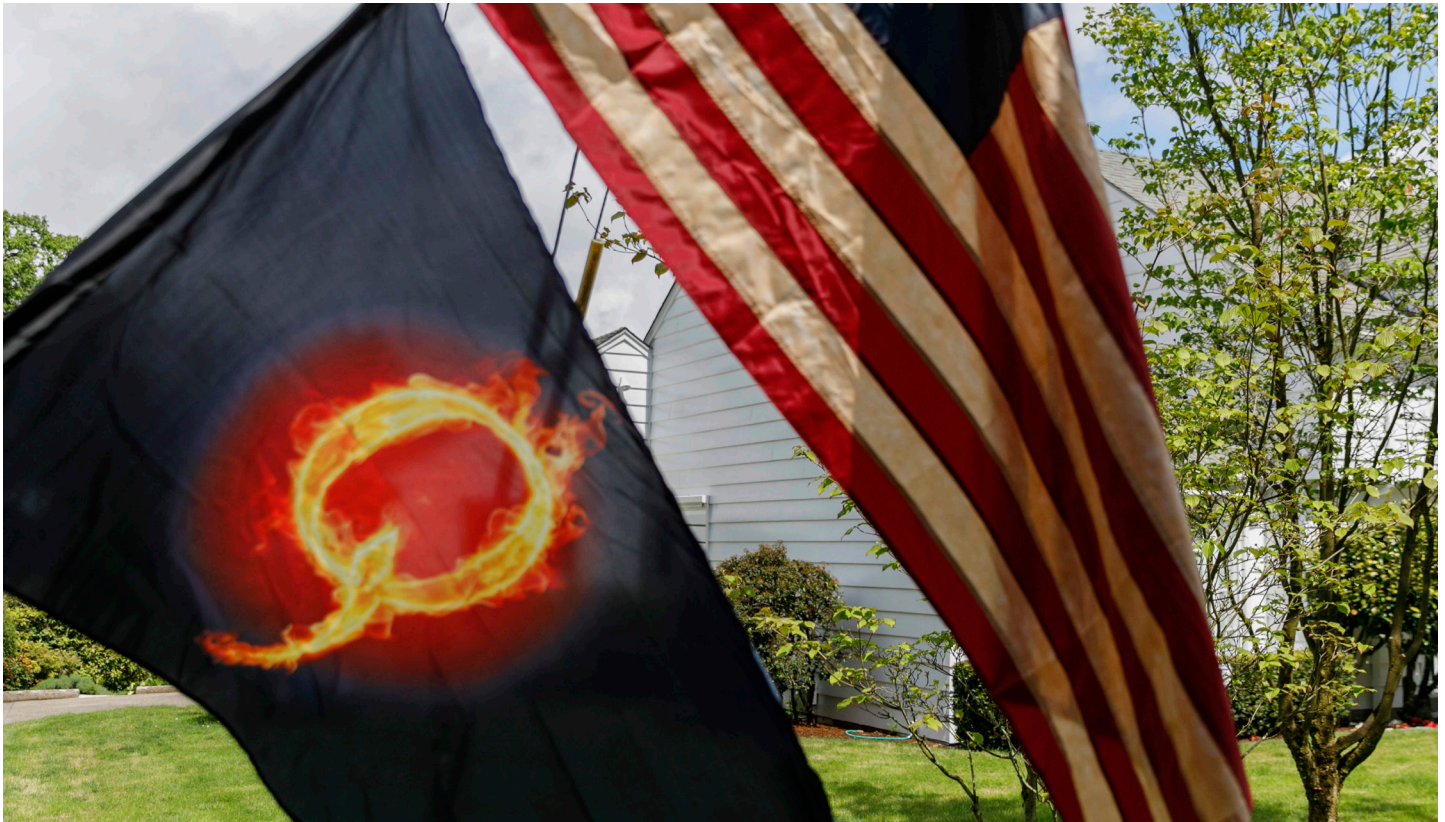
A QAnon flag is held by a protester at the Governor's Mansion, in Salem, Oregon, on April 25, 2020, during a rally against economic-closure efforts aimed at minimizing the impact of COVID-19.