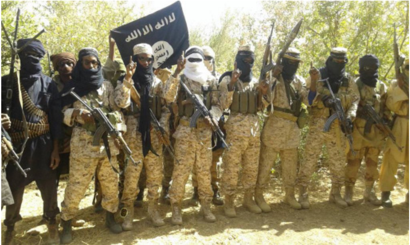
ISGS fighters in Burkina Faso, seemingly during a pledge ceremony to the Islamic State, in an undated picture obtained by the authors in April 2018

tensions in the Sahel in a video released by its Yemen Province in April 2020, which accused al-Qa`ida of “deviating” following the Arab Spring protests. 108 In regard to the Sahel, the video strongly denounced AQIM’s actions in the 2012 jihadi takeover of northern Mali and condemned AQIM and its then leader, Abdelmalek Droukdel, for working with “apostate movements,” namely the National Movement for the Liberation of Azawad, in the occupation. u