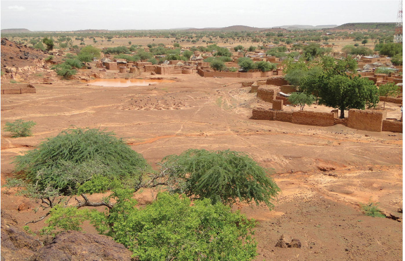
Sahel Region, Burkina Faso.

they can get instrumentalized by the state to fight on its behalf, particularly in regions where the state is too weak to project its own power. 21