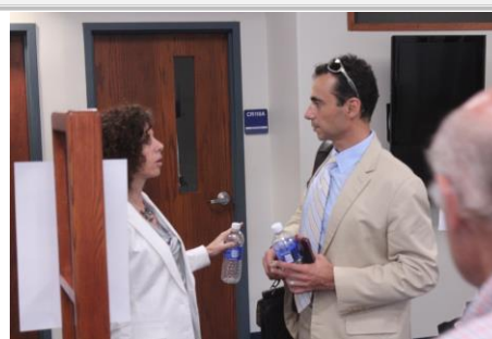
... quick consultations