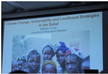
Slides of presentations

Held on the 20 th of September 2014 at Career Resource Center Library Vol: 1 No : 1 (Production:Dr Kole Odutola)