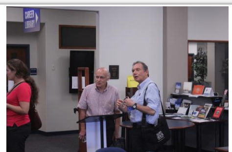
....after the presentation, time to go