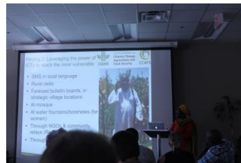
...Slides from the PM session