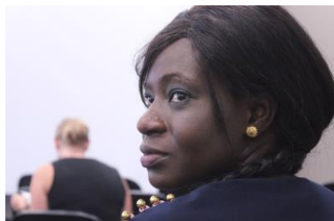
Looking to the future